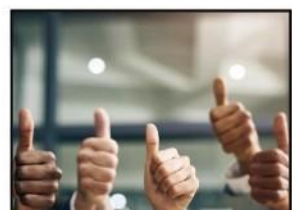
Other Supporting Documents