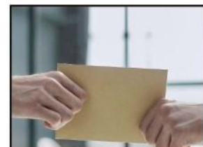
Recommendation Letter (Optional)