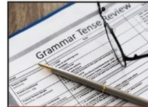
Latest official English transcript