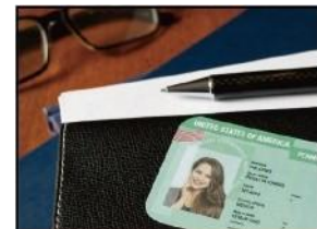
Photo ID Both Sides