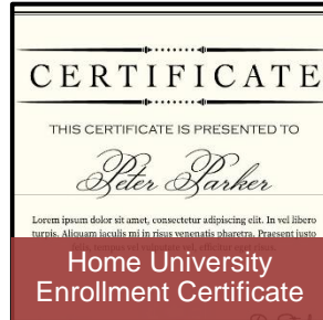
Home University Enrollment Certificate