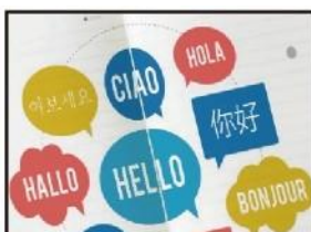
Chinese/English Proficiency Certificate