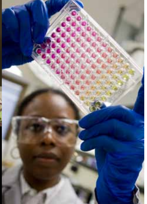
Many of the faculty at Temple University take a hands-on approach to teaching and incorporate experiences outside the classroom into their curriculum. Facilities around campus provide advanced technology and modern lab spaces for student learning and research.