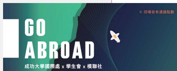
Upper portion of the post promoting the "Go Abroad" forum held on the NCKU campus at the beginning of the 2018 Fall Semester.

Our Internationalization Information and Service Division (IISD) and NCKU Student Union co-hosted a 4-night "Go Abroad" forum on September 28 th , and October 1 st to 3 rd , in coordination with our International Relations Division (IRD). This forum was held to encourage NCKU students to study abroad in both short-term student exchange programs and graduate degree programs. During the first two nights, Taiwanese who had worked or conducted research abroad in Cambodia, Russia, and Australia discussed how living abroad had provided valuable learning and life experiences, and had promoted self-discovery and a clearer sense of self. On the third night, recent NCKU students who had gone abroad in exchange programs and current international exchange students at NCKU shared their experiences in adapting to life in foreign cultures. On the final night, NCKU alumni who had obtained their master's degrees in the UK provided valuable insights on preparations for and precautions while studying abroad.