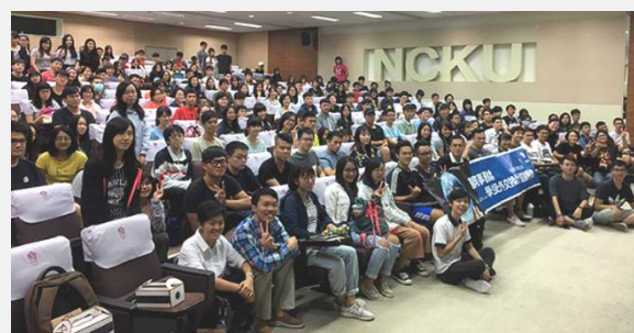
A large number of NCKU students attending the opening night of the 4-night forum.