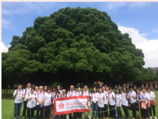
Visiting Malaysian high school principals, teachers, and counselors at the famous Banyan Garden of the NCKU campus.