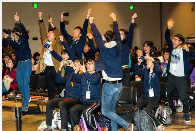
The 2018 NCKU iGEM Team members celebrating the competition results.

These successful team efforts involving both overseas Chinese students and domestic students not only highlight the importance of outstanding academic knowledge and the ability to work with scholars in other disciplines, but also demonstrate the growing diversity and internationalization of our student body. Our Overseas and Mainland Chinese Students Affairs Division has been dedicated to the recruitment of exceptional overseas and mainland Chinese students, as a part of this division's long-term mission of enhancing the overall academic performance of our university.