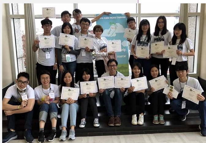
The 2018 NCKU iGEM Team members receiving their hard earned Gold Medal and project awards.

Overseas Chinese students were important members of the Gold Medal winning NCKU iGEM Teams at iGEM competitions.