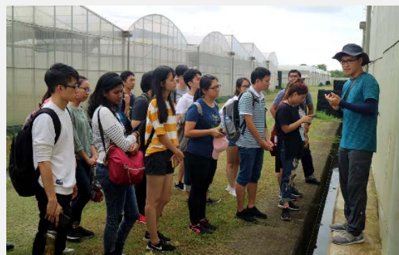
Students listening to their guide on a field trip to the Taisugar greenhouses located in Tainan, during the 2018 NCKU International Summer School.