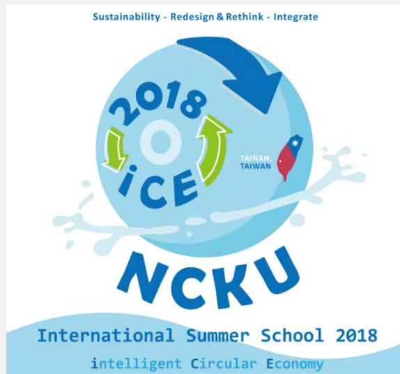
Official poster announcing the “intelligent Circular Economy” or iCE 2018 course.