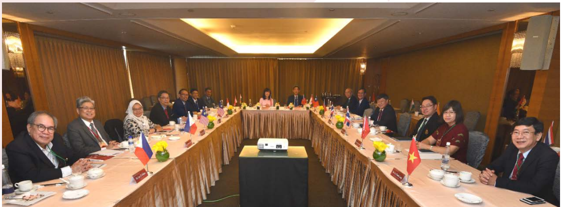
2018 SATU Steering Committee Annual Meeting November 16, 2018, Tainan, Taiwan.

The Joint Research Scheme (JRS) represents one of SATU's most successful programs, resulting in an increasing number of collaborations among researchers in member universities.