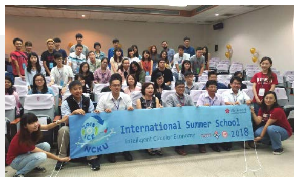
Students, instructors, and directors of the 2018 NCKU International Summer School at the opening ceremony.

The field trips were among the most popular activities of this program and exposed these students to the real-world applications of circular economy methods being utilized currently by Taisugar. This domestic company has been actively exploring how to employ such methods to both increase profits and better protect and sustain our natural environment.