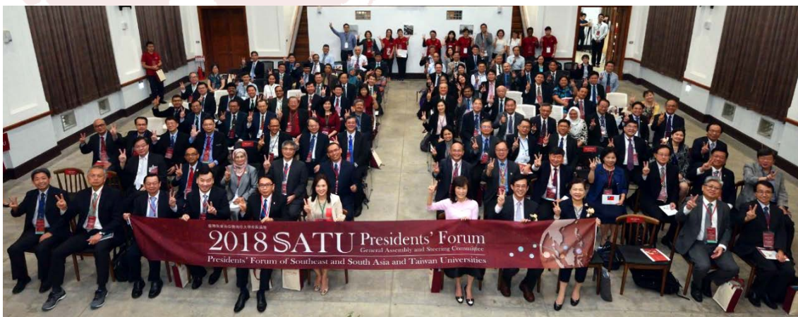
High-ranking administrators representing the highest-ranked institutions of higher learning located in India, Indonesia, Malaysia, the Philippines, Singapore, Taiwan, Thailand, and Vietnam attending the 2018 SATU Presidents' Forum – General Assembly, November 16–17, Ge-Chi Hall of NCKU, Tainan, Taiwan.

Thirty-nine foreign universities sent high-ranking administrators to participate in the 2018 SATU General Assembly, a 25% increase compared with any assembly since 2012.