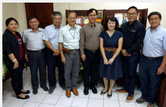
NCKU faculty members and ISAD representatives visiting with administrators and faculty members of the National University of Laos, located in Vientiane, Laos.