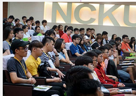
Overseas and mainland Chinese students attending NCKU's annual new student orientation.

The annual 2018 Overseas and Mainland Chinese New Student Orientation, held on September 3 rd , was hosted by our Overseas and Mainland Chinese Students Affairs Division (OMCSAD), with assistance from our campus's Overseas Chinese Students Association (OCSA) and Mainland Chinese Students Association (MCSA). There were 220 new students in attendance, including 154 overseas and 66 mainland Chinese students. The overseas Chinese students came primarily from Malaysia, Hong Kong, Macau, Indonesia, and Myanmar, with a smaller number arriving from Vietnam, Thailand, Canada, the United States, Brazil, Spain, Paraguay, Malawi, South Africa, and Japan.